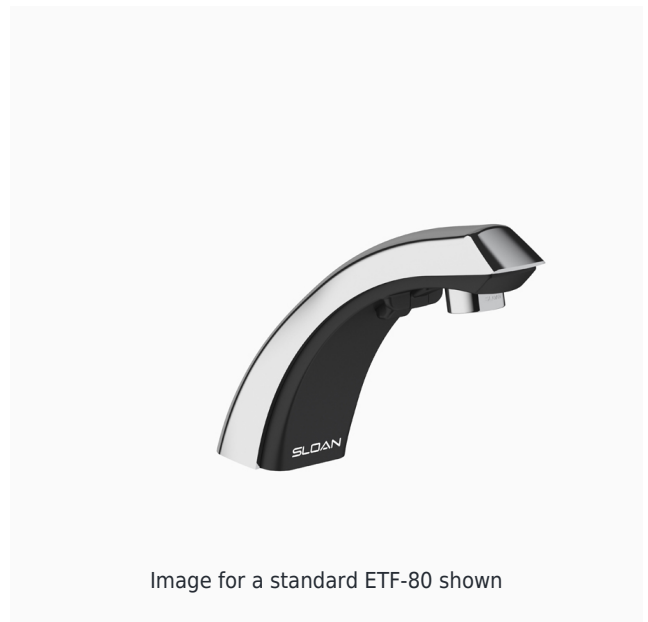
Image for a standard ETF-80 shown