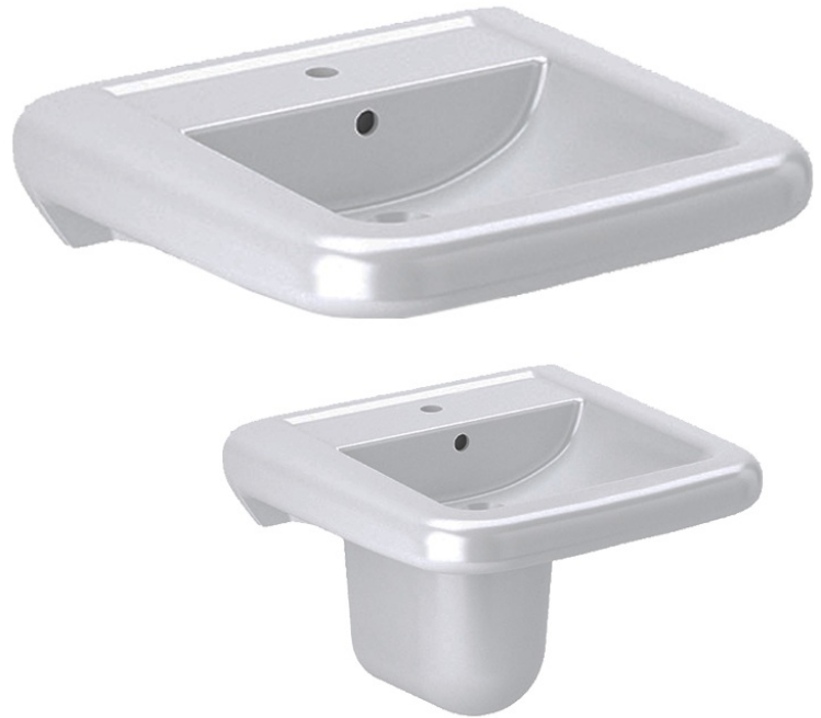
SS-3165 shown with optional SS-27 Shroud

Sink shall be made of vitreous china. Sink shall be wall mounted. Sink shall have a rear overflow. Sink shall be single hole centerset. Sink shall be Sloan Model SS-3165.