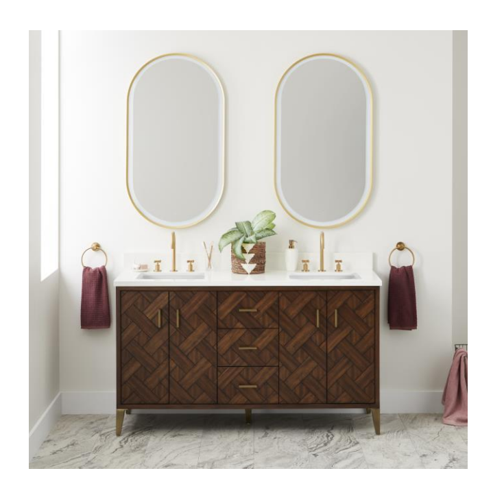
ASME A112.19.2/CSA B45.1 Massachusetts Accepted

Code: SH497546, SH497547, SH497548, SH497549, SH497550, SH497551, SH497552, SH497553