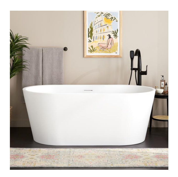
CODES/STANDARDS CSA B45.5/IAPMO Z124