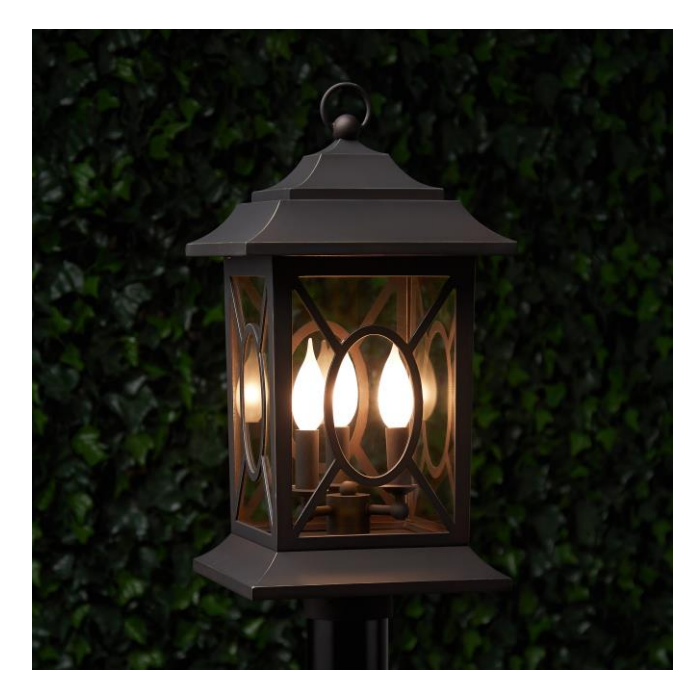
CODES/STANDARDS UL 1598 / CSA C22.2 No 250.0