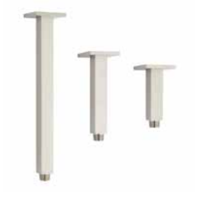
Revised: 01/19/2021 Code: SHRSC40S, SHRSC60S, SHRSC120S