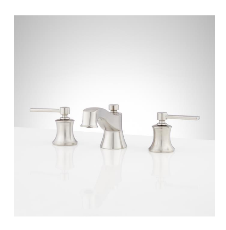
ASME A112.18.1/CSA B125.1 NSF/ANSI/CAN 61-9:Q≤1