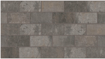
500 Sunset Street