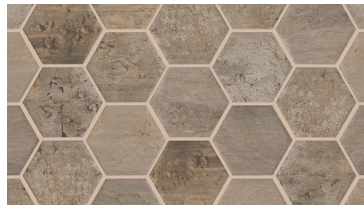
750 Brick Lane