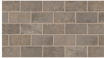
750 Brick Lane