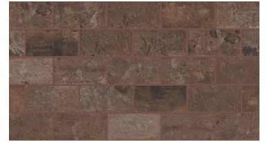
860 Urban Fog