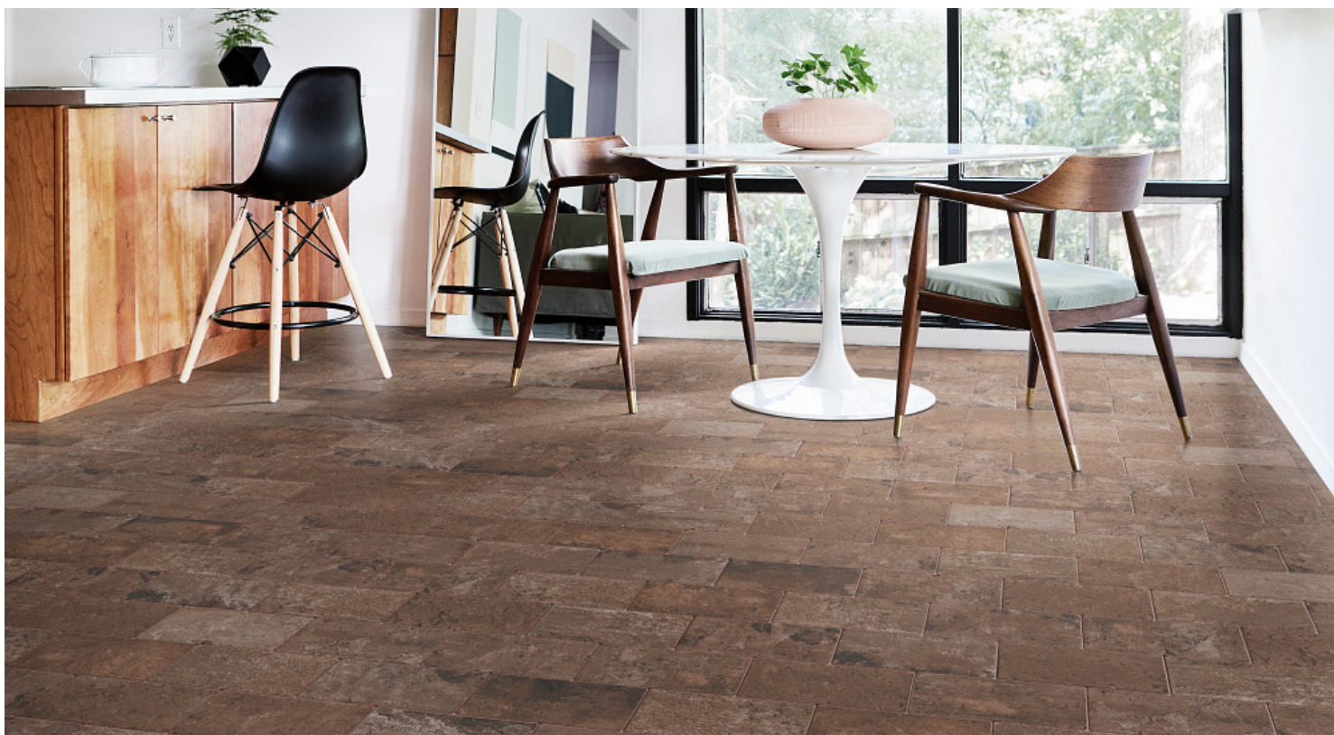
860 Urban Fog