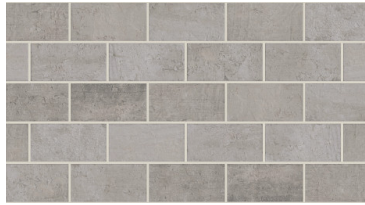
510 Highrise Grey