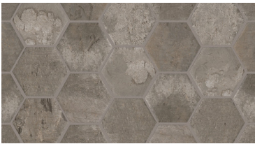
500 Sunset Street