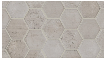
510 Highrise Grey