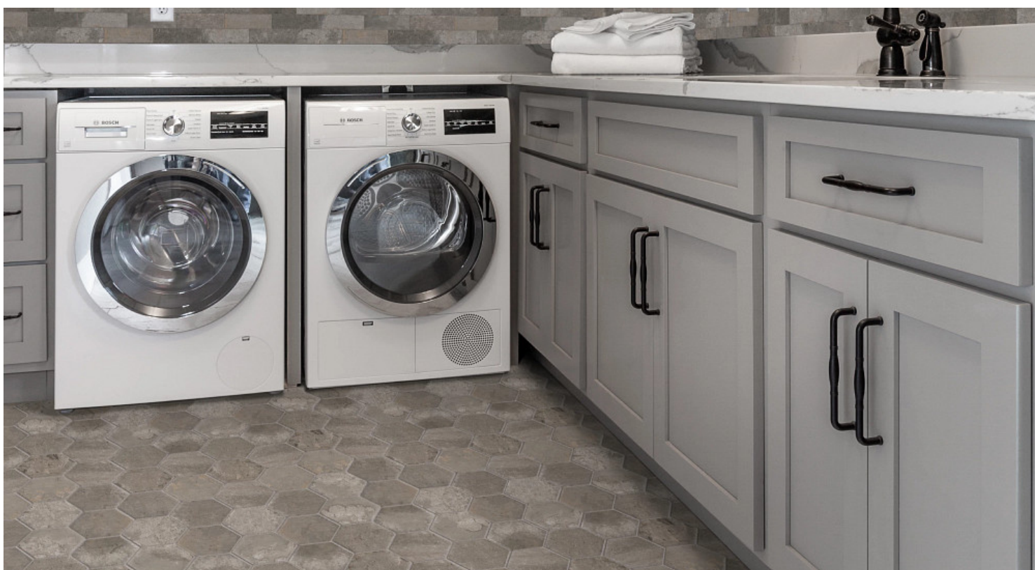
500 Sunset Street