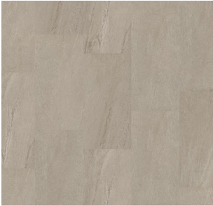
1173 Beige Slate