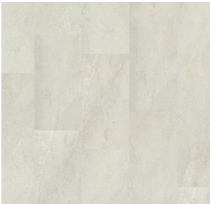
1174 Ivory Soapstone