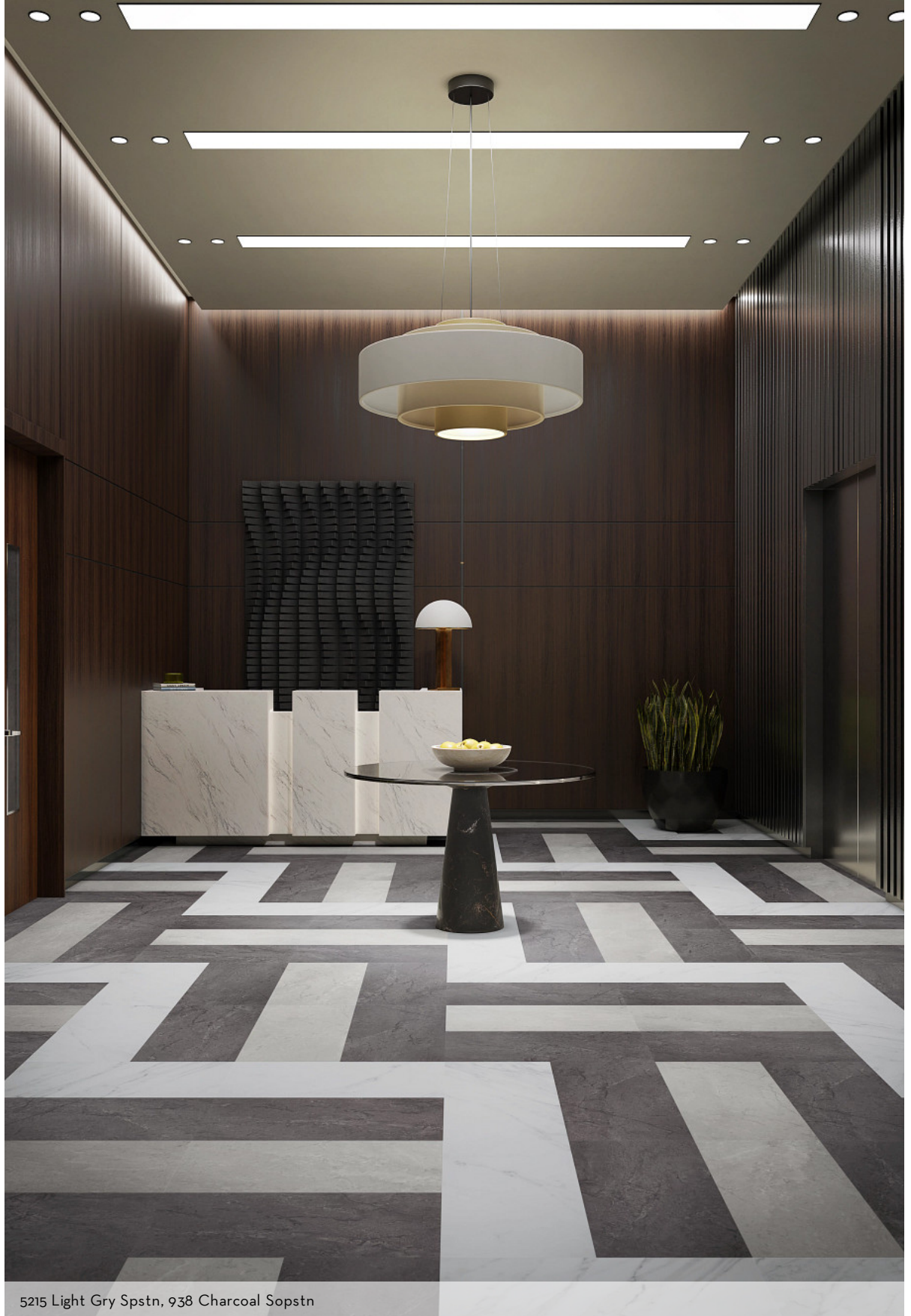
5215 Light Gray Soapstone, 938 Charcoal Soapstone