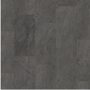
938 Charcoal Soapstone