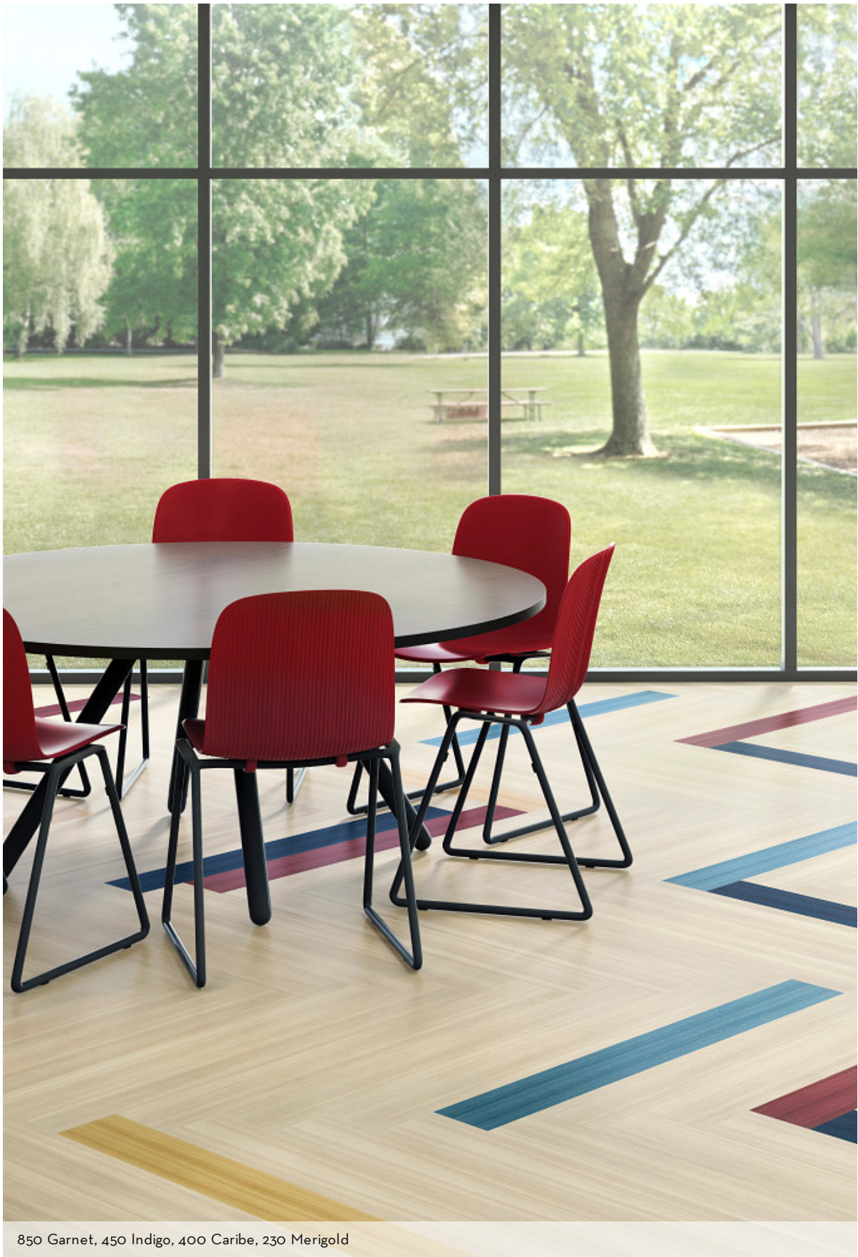
850 Garnet, 450 Indigo, 400 Caribe, 230 Merigold