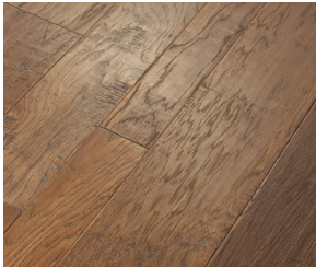
2000 Pacific Crest