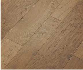
7071 Cassia Bark