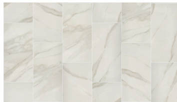
150 Bianco Covellano