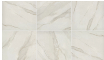
150 Bianco Covellano