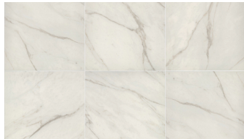
121 Golden Calacata