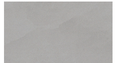
550 Dark Grey