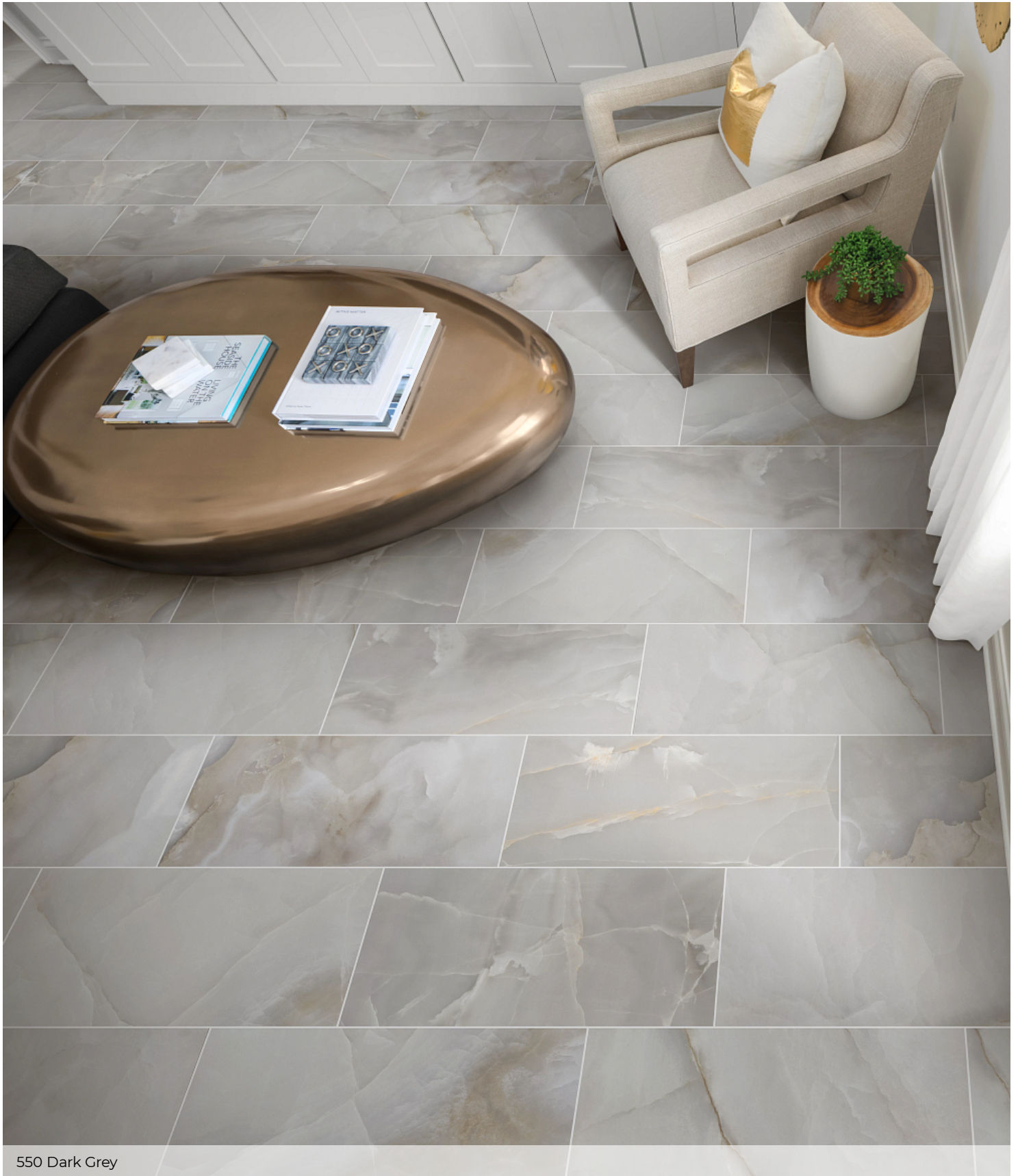
550 Dark Grey