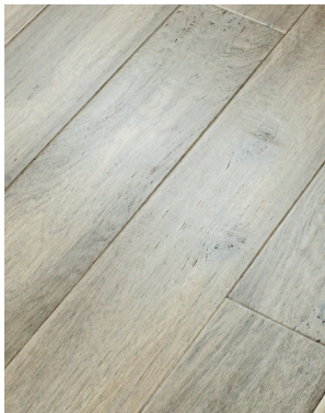
5060 Pearl Grey