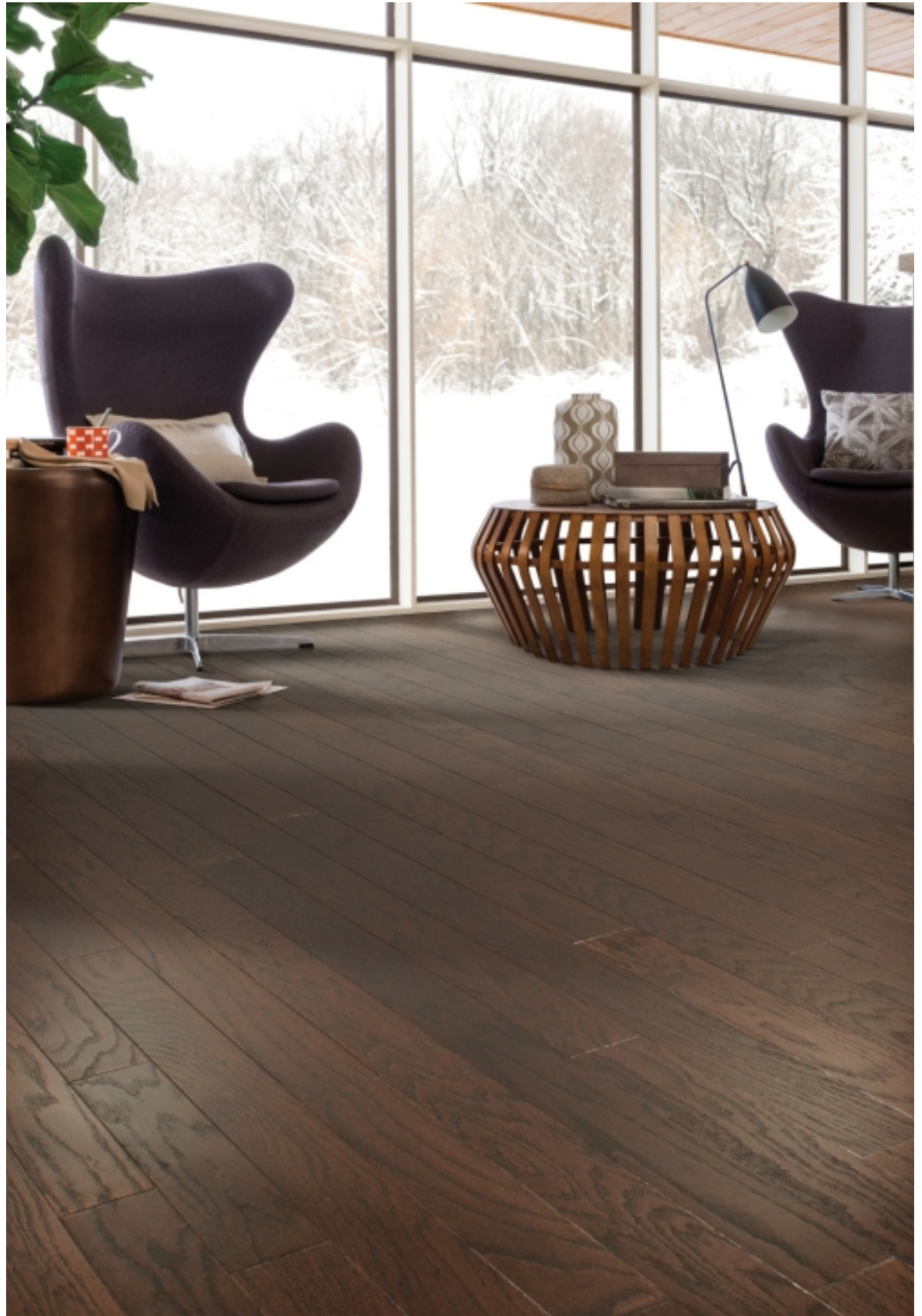
958 Coffee Bean