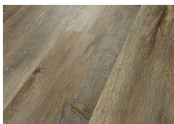
709 Modeled Oak