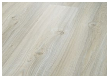
509 Washed Oak