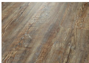
717 Tattered Barnboard