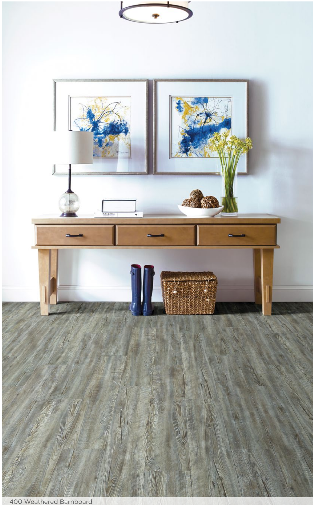
400 Weathered Barnboard