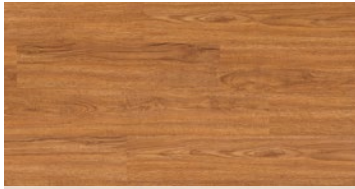
260 Sweet Auburn