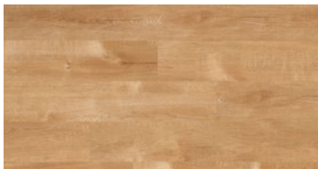
240 Solana Beach*