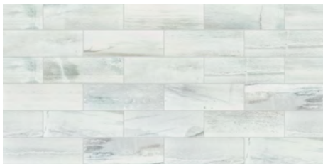
125 White Water