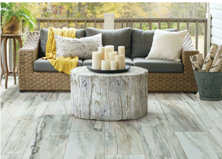
152 Niagara Crush