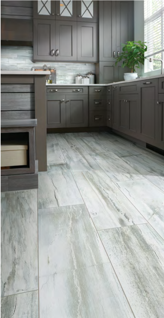
510 River Rush