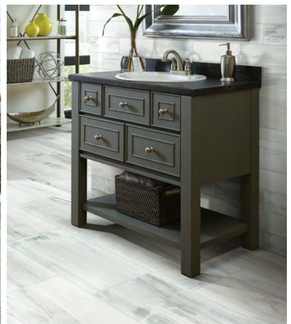
125 White Water