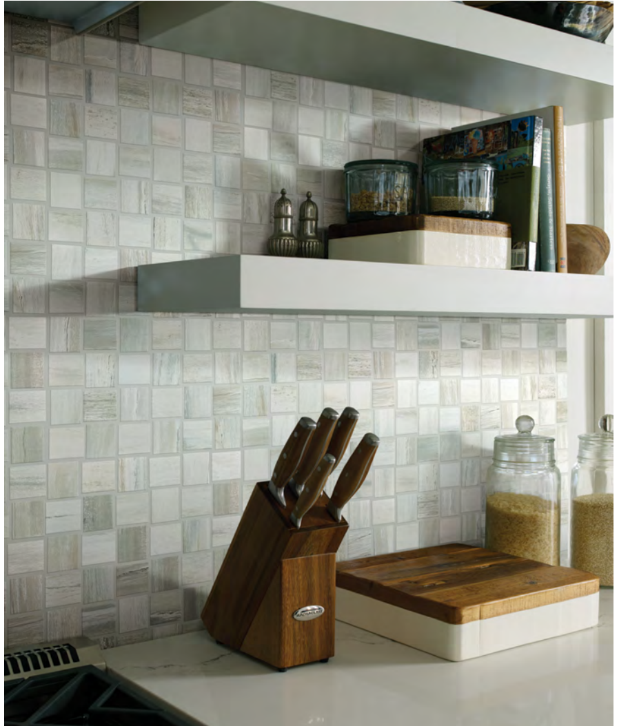
Basketweave Mosaic | 125 White Water