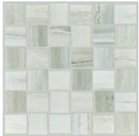
125 White Water