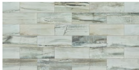
152 Niagara Crush