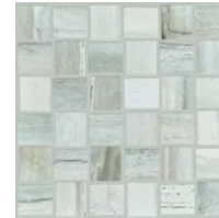
510 River Rush