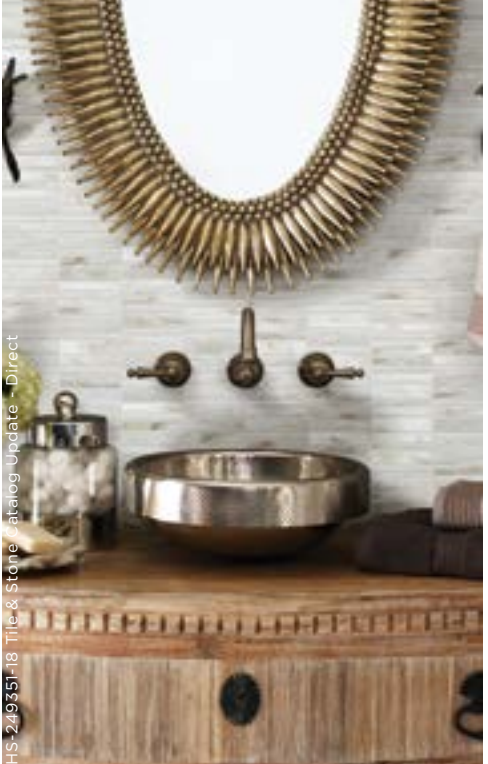
120 Gardenia (random stacked)