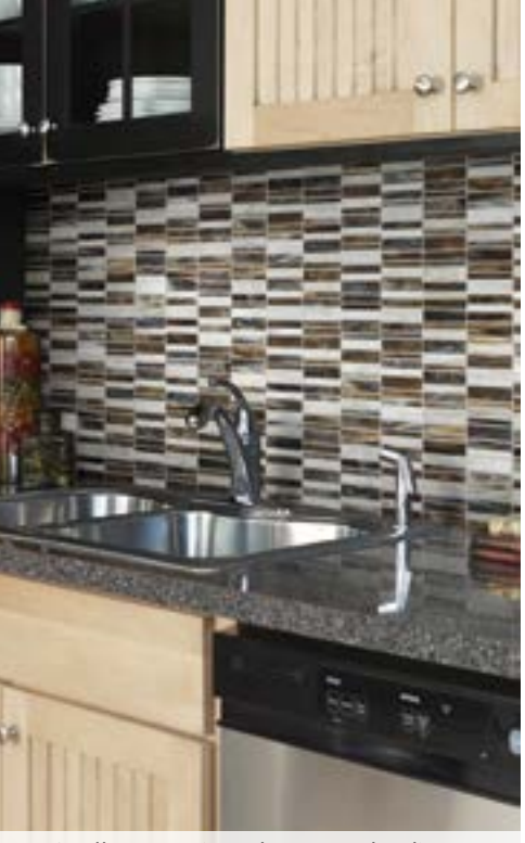
210 Honeycomb (random stacked) 710 Elk Horn (random stacked)