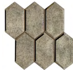
500 Antique Silver

CS36Z Beveled Hexagon Mosaic Mirrored 11.92" x 11.55" walls 10 pieces per box SF per box: 9.59