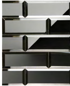
500 Antique Silver

CS35Z Beveled Mirror Tile Mirrored 3" x 9" walls 28 pieces per box SF per box: 4.95