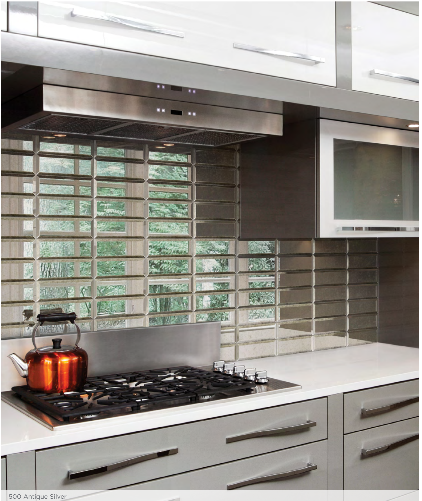
500 Antique Silver