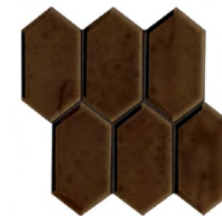
600 Antique Bronze