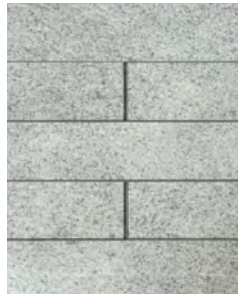
500 Antique Silver

CS34Z Antique Mirror Tile Mirrored 3" x 12" walls 20 pieces per box SF per box: 4.71