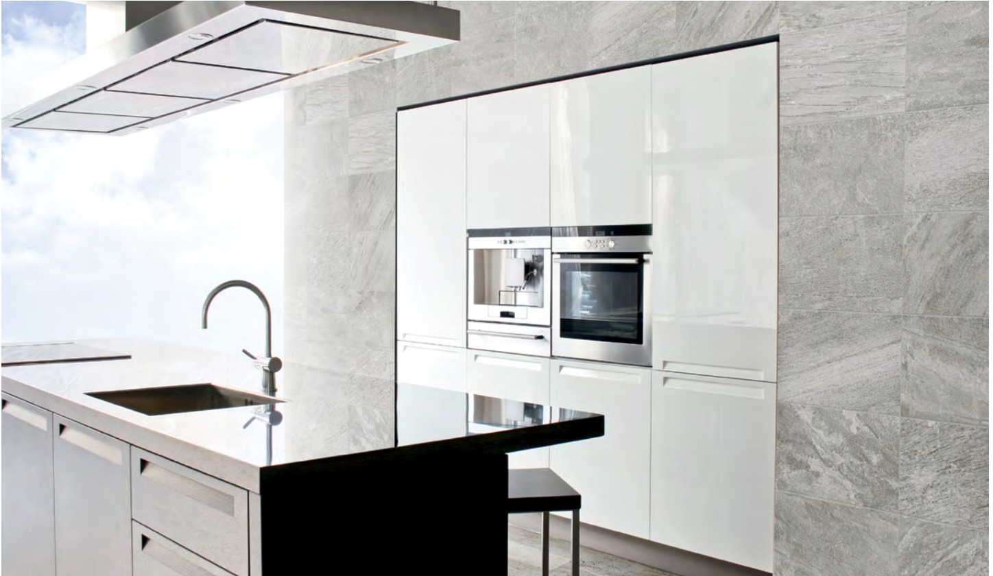
550 Dark Grey