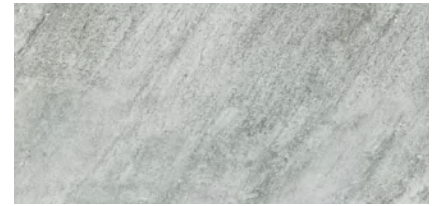
550 Dark Grey