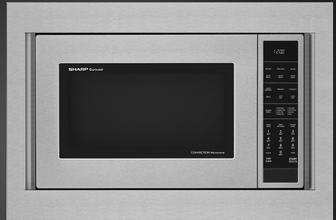
SMC1585BS Convection Microwave Oven with the RK-94S30 Trim Kit

Always Refer to the Installation Guide for Recommendations