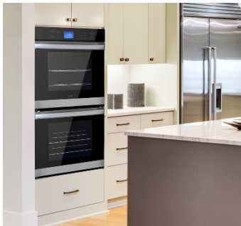
The SWB3052DS is more than just beautiful and functional, it is a must-have for home entertaining.

The Sharp SWB3052DS built-in double wall oven features edge-to-edge stainless steel, black glass and clean sight lines that flow with your lifestyle, and pair beautifully with other stainless steel appliances. With decades of experience designing innovative cooking appliances, it's easy to see why cooks around the world trust Sharp.