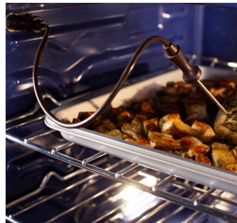
Upper oven probe thermometer monitors internal temperatures for precise control.