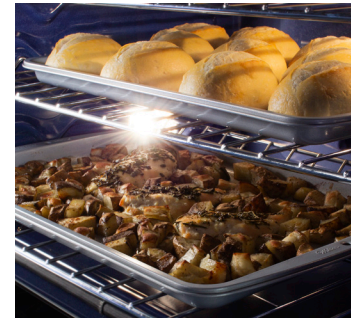
The bright, halogen interior lighting and large viewing pane let you keep an eye on your food from the outside.

SHARP ELECTRONICS CORPORATION 100 Paragon Drive, Montvale NJ, 07645 1.800.237.4277 • www.sharppusa.com