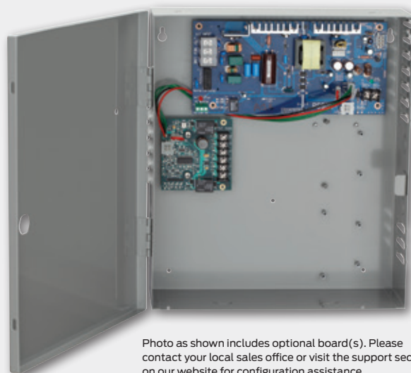
Photo as shown includes optional board(s). Please contact your local sales office or visit the support section on our website for configuration assistance.