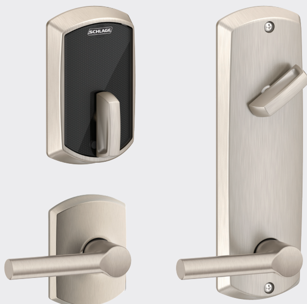
Schlage Control™ Smart Interconnect Lock with Greenwich trim in Satin Nickel with Broadway Lever