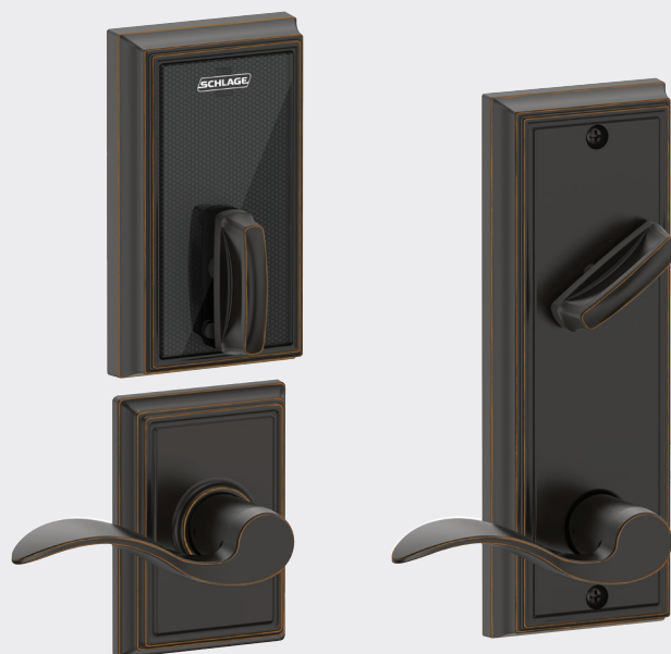
Schlage Control™ Smart Interconnect Lock with Addison trim in Aged Bronze with Accent lever