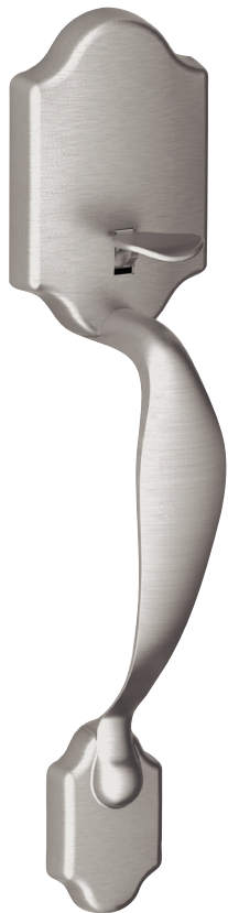
Satin Stainless Steel Paris Handleset