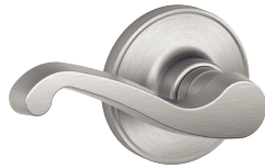
Satin Stainless Steel LaSalle Lever