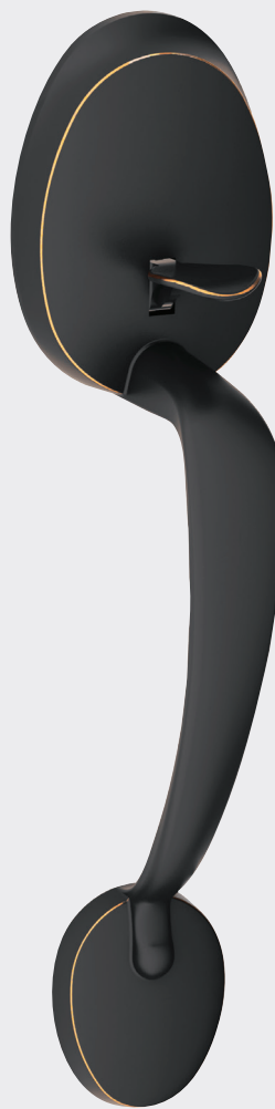
Aged Bronze Barcelona Handleset