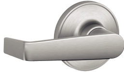
Satin Stainless Steel Marin Lever