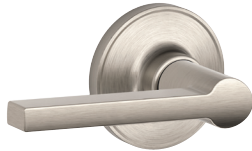
Satin Nickel Solstice Lever