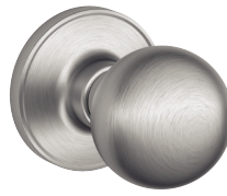
Satin Stainless Steel Corona Knob