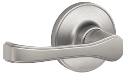
Satin Stainless Steel Torino Lever