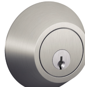
Satin Stainless Steel Deadbolt