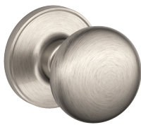
Satin Nickel Stratus Knob