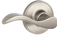
Satin Nickel Seville Lever