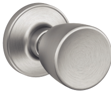
Satin Stainless Steel Byron Knob