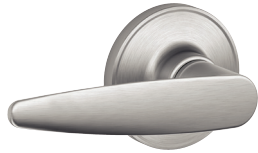
Satin Stainless Steel Dover Lever