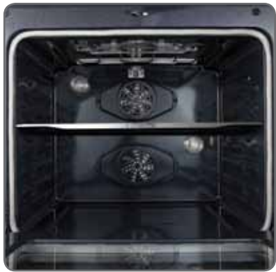
Generous 5.9 cu. ft cavity has more flexibility with a divider.