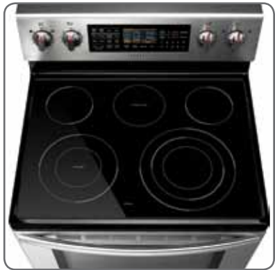
Controls at your fingertips with an easy to read LED display.