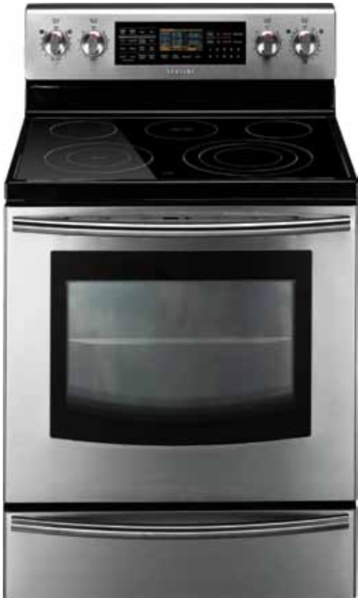
Easy to use cook top and oven with a 1.4 cu. ft. Warming Drawer.