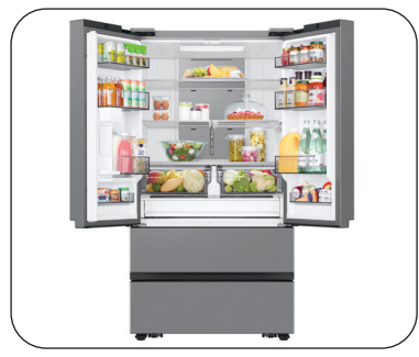
Large 31 cu. ft. Capacity