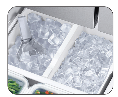
Dual Auto Ice Maker