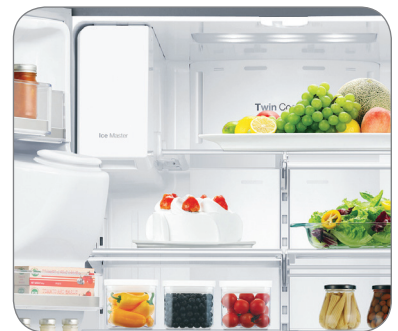
Ice Master Ice Maker