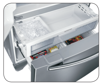
Automatic Filtered Ice Maker in Freezer