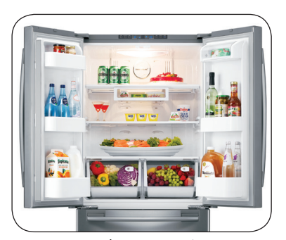
French Door Design