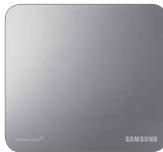
Shiny Mirror Design