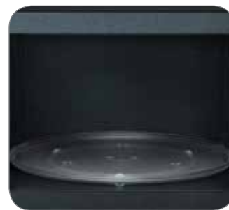
Ceramic Enamel Interior