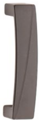
CP 671 RB (96mm c/c)