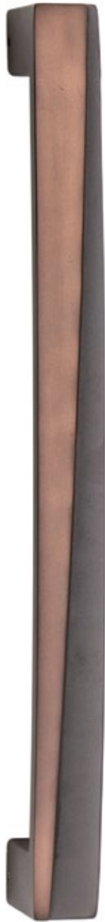
PH 6671 CFB (12" c/c)