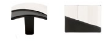
side view / top view pictured in polished nickel w/ black