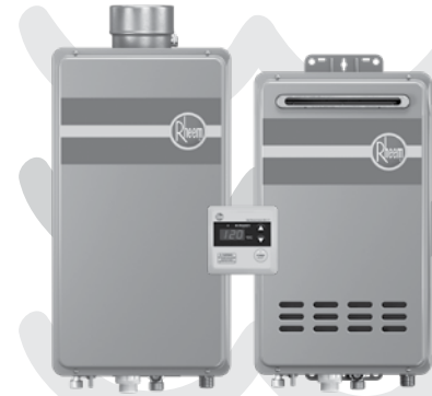
RTG-DVL Indoor DV 11,000-199,900 BTU/h Natural and LP Gas RTG-XL Outdoor 11,000-199,900 BTU/h Natural and LP Gas