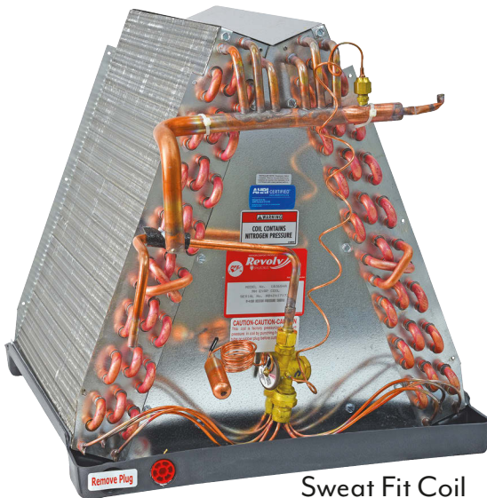
Sweat Fit Coil