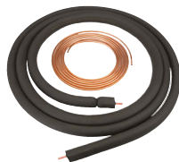
Sweat Fit Line Set