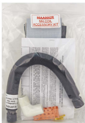
Coil Accessory Kit

Designed Exclusively For Manufactured Housing with optimized airflow and compatibility with most new and existing MH furnaces, which makes these the perfect choice to complete a home-comfort system.