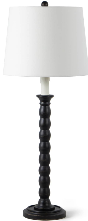
Perennial Buffet Lamp (Ebony) 13-1543EB