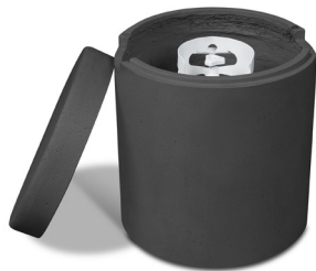
1597-CNBL Pairs with the La Valle collection in CBN