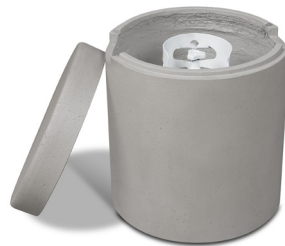
1597-FOG Pairs with the Carson collection in FOG and the La Valle collection in FLNT