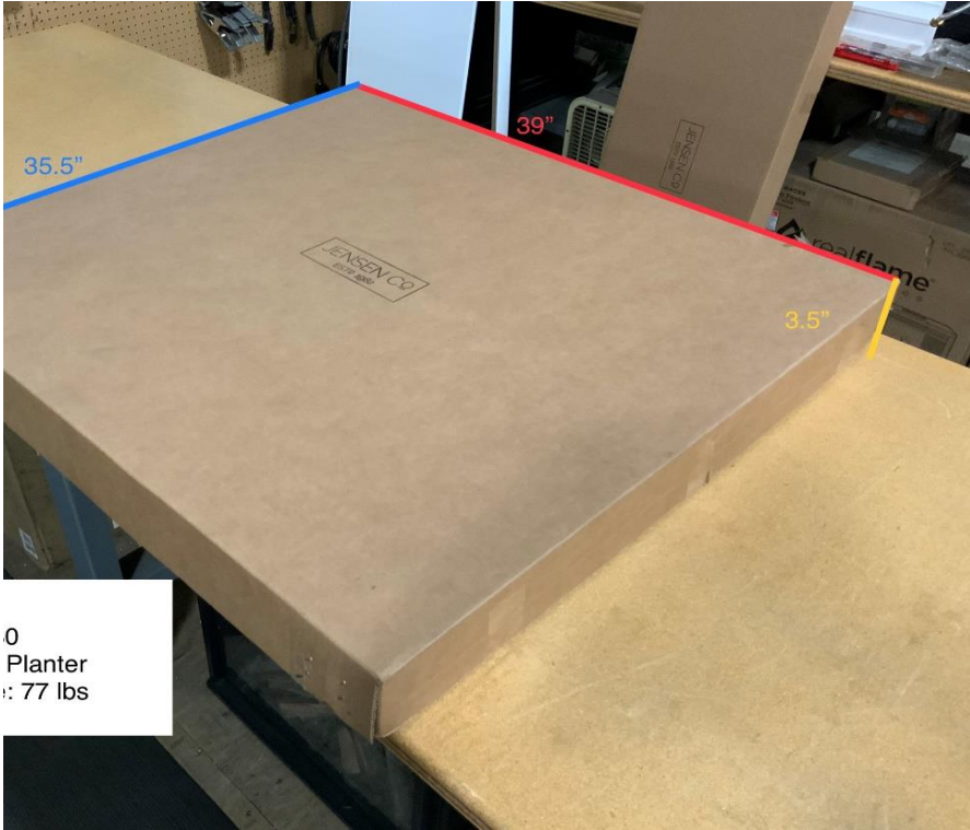
0 Planter : 77 lbs