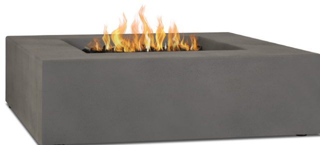
Shown in carbon