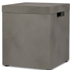
Optional Tank Cover (135) Shown in flint