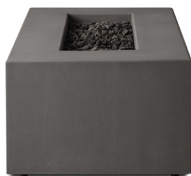
Shown in carbon