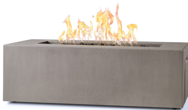
Shown in flint