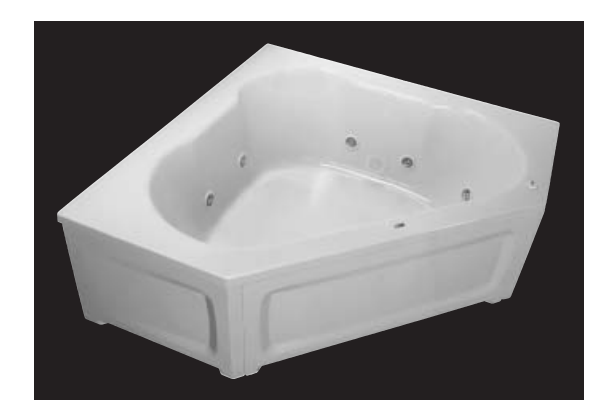
With Integral Skirt