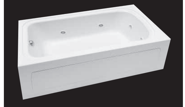
With Integral Skirt