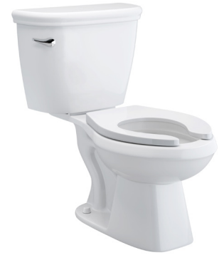
PF1601PAWH / PF1612PARWH