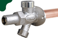
P-264 Loose Key Design