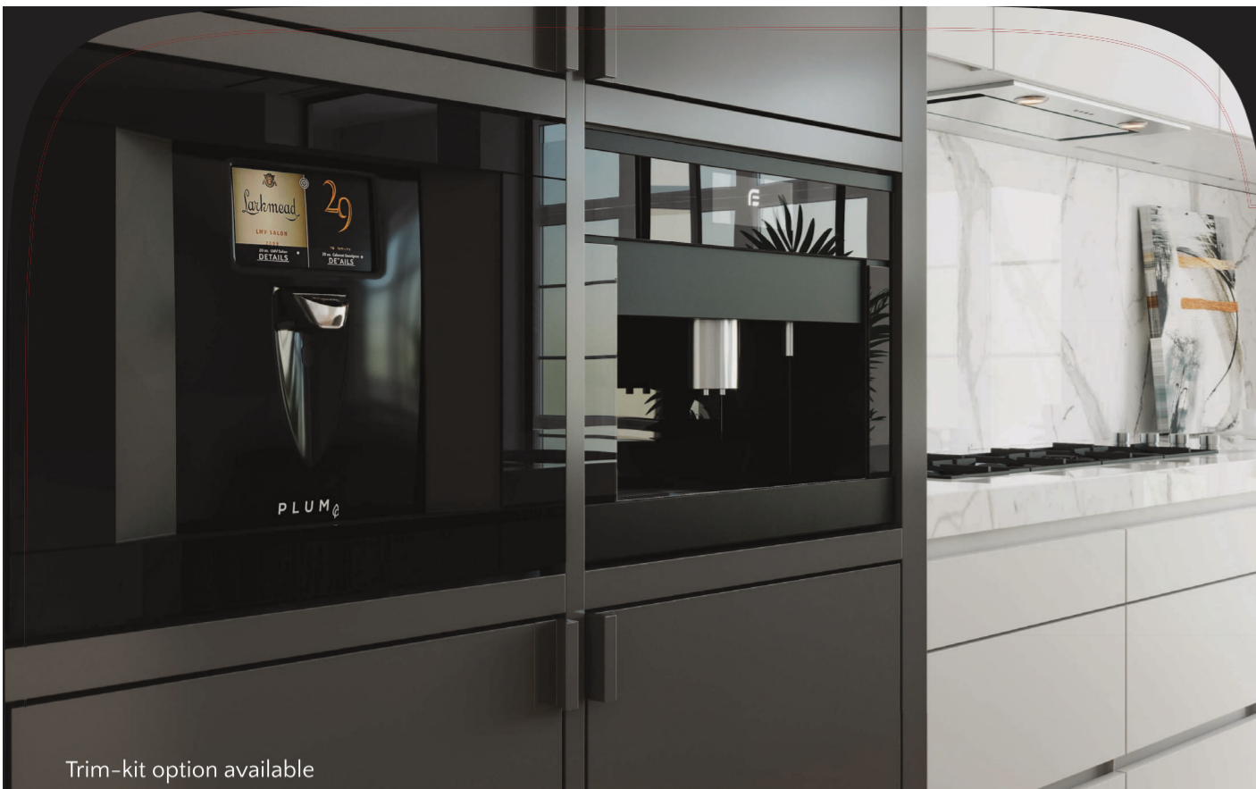
Trim-kit option available