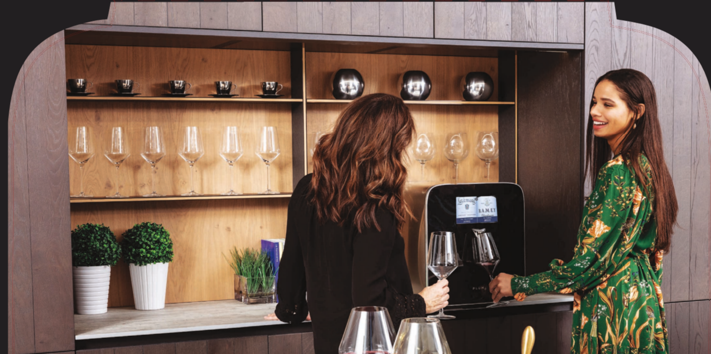
30% of adults live in a household where one person likes red wine & the other white wine

Plum automatically identifies the vintage, varietal, region, winery and wine, connecting to rich content that lets you step into the tasting room without leaving your home