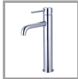
#3MT168 SHOWN * ADA