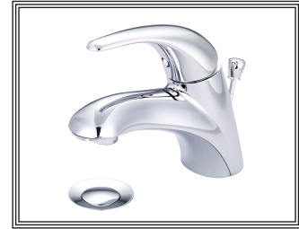
#3LG260H SHOWN * ADA