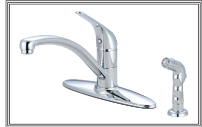
#2LG161H SHOWN * ADA