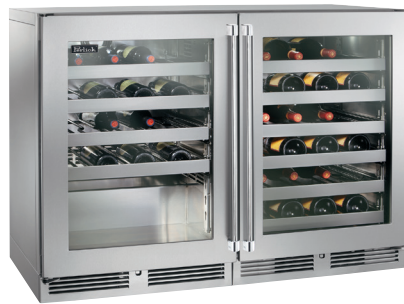
All Glass Door Model