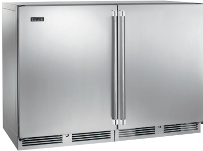
All Solid Door Model